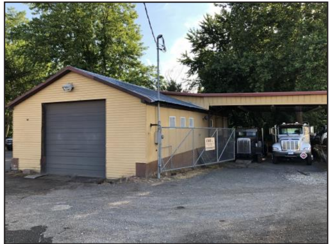
The CSB garage on Brownstone Avenue where all building and maintenance is performed.