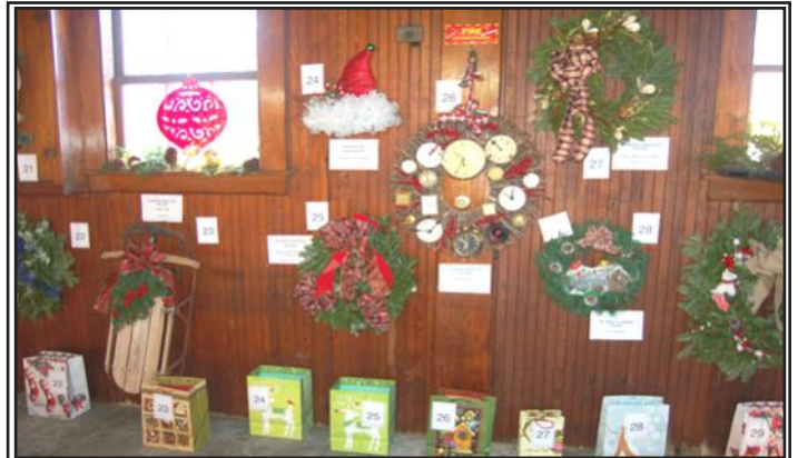
2019 Festival of Wreaths display