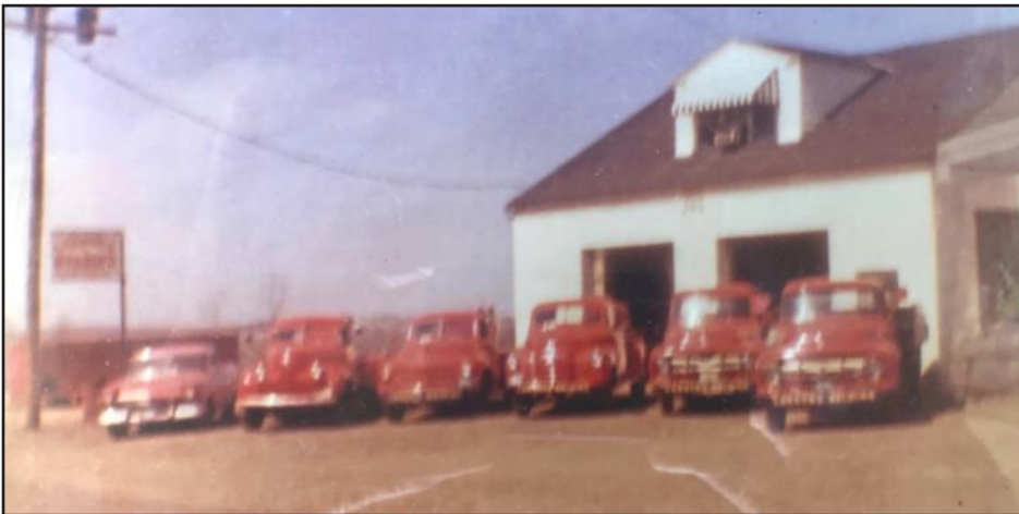
Larson Welding truck fleet circa 1958