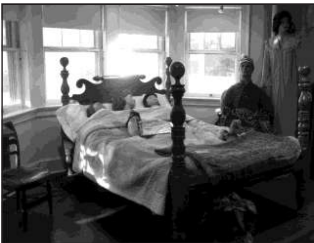
The children "slept tight" in the antique roped bed.