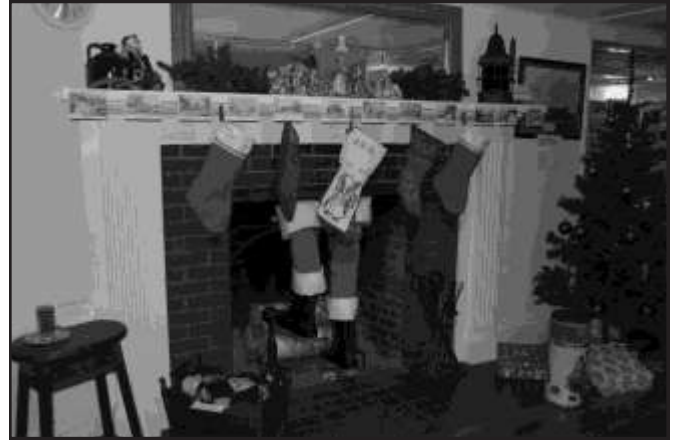
Santa leaving the Society's Holiday Exhibit

organization and museum function; and to the many members and friends who have supported our activities throughout the year.