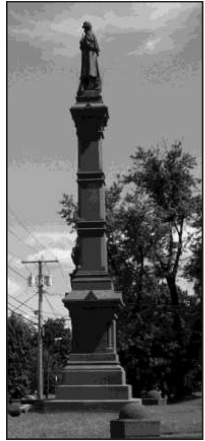
Portland's Civil War Memorial

Membership Programs and meetings. For further details, please watch the Rivereast News Bulletin.