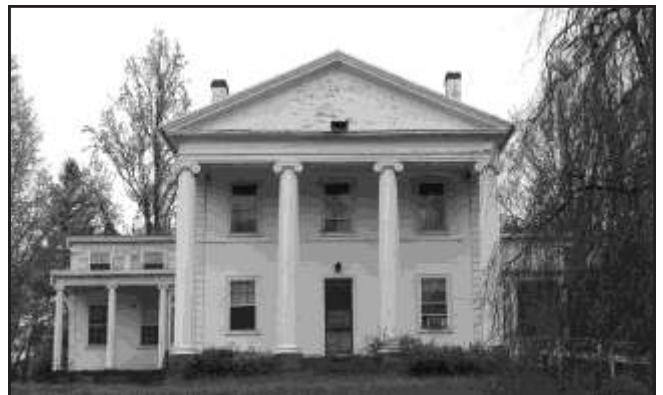
Hart - Jarvis House in 2009