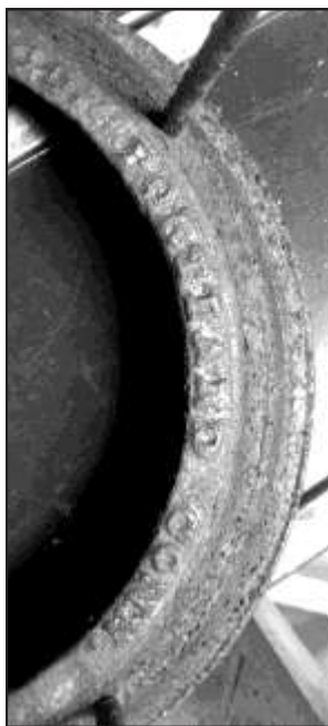
Left - Heath & Smith gas lamp (converted to electricity) Right - closeup of "Portland, Conn" on frame of lamp