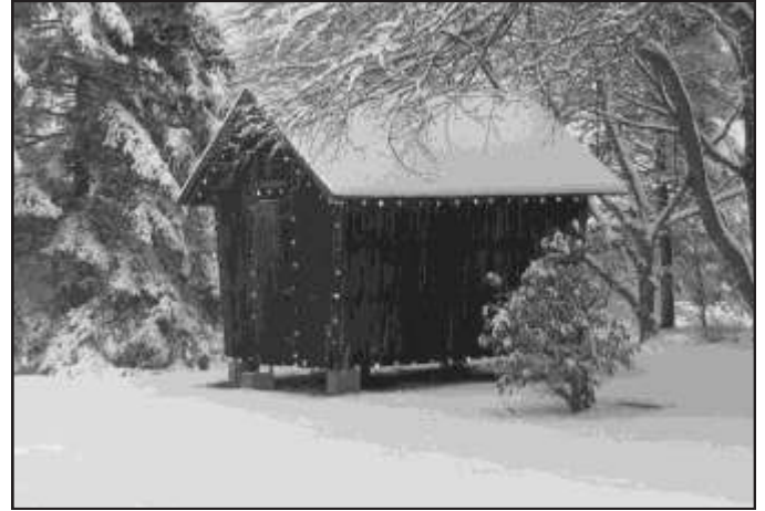
The Hedstrom-Carlson Corn Crib donated by the Mattabeseck Audubon Society in its new home behind The Ruth Callander House Museum of Portland History and suitably decorated for the holidays.