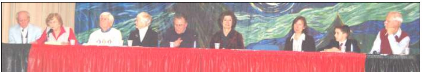
Brownstone School 75th Anniversary Discussion Panel

Potluck Picnic: The annual Potluck Supper is scheduled for Tuesday, June 24, 2008, at the Fireman's Picnic grounds, at 6 pm. The picnic is held rain or shine. Please bring a salad or casserole to serve 6-8 people. The Board will provide desserts. I hope to see you all there!