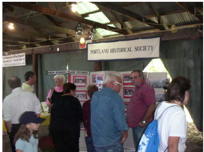
The Society's popular booth at the fair

We hope you will join us again for 2007 as we continue to operate the Ruth Callander Museum of Portland History, which has hosted thousands of visitors, including local grade school classes, since our Grand Opening in 2003; continue to collect, exhibit and preserve Portland artifacts for the enjoyment of future generations; and, continue to offer historical and cultural programs free of charge for residents of the community.