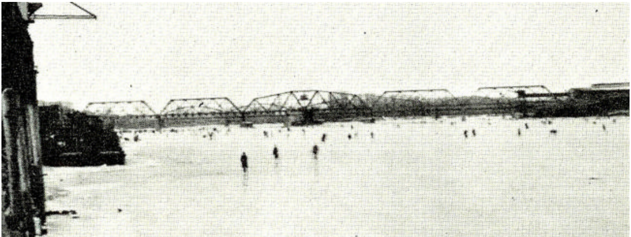
River travelers - 1898 bridge in background

(Suffering annoyance saved bridge tolls!)